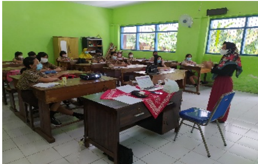
Figure 1. Delivery of Materials

partnership program, both during knowledge socialization, mentoring, and active participation during the presentation of the material.