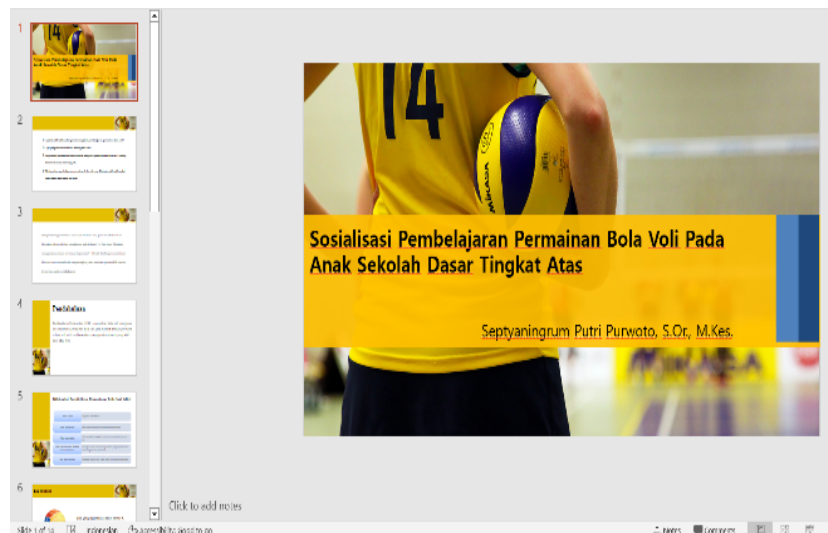
Figure 4. Socialization Materials

The community service activity with the theme of Volleyball Game Learning Education in Upper Elementary School Children was carried out with the aim of broadening the horizon and increasing students' understanding of the game of volleyball. The main focus of this activity includes the introduction of basic techniques, understanding the rules of the game, and instilling sportsmanship during play. The target of the program is students in grades IV to VI of elementary school who are physically and motor able to participate in big ball sports learning.