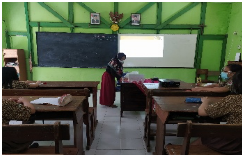
Figure 2. Material Appearance