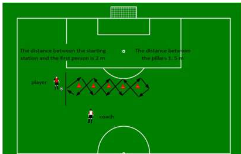
Figure 1. Demonstrates the rolling test between (5) signs back and forth

The tools used in the test include a line drawn at (2 m) from the first sign, and four consecutive signs with (1.5 m) between each sign and another, in addition to footballs, a stopwatch, and a whistle for direction. The test is performed by individuals rolling the ball quickly at the start signal, passing through the five signs and returning to the original point as quickly as possible. The test time is recorded accurately to the nearest 1/100 of a second, with the aim of providing an accurate assessment of everyone's performance on the test.