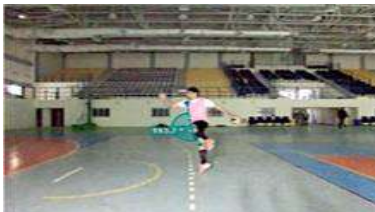
Figure 2. Illustrates how to extract hip joint angle with pivot leg