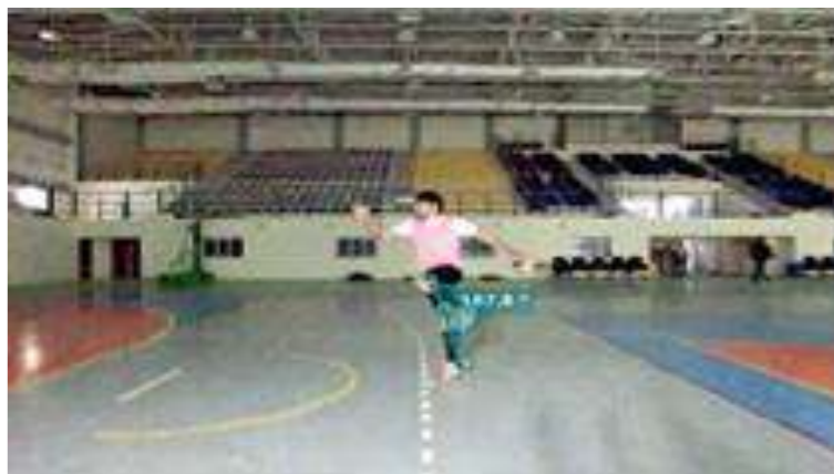
Figure 1. Illustrates how to calculate knee angle