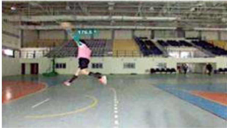
Figure 3. Illustrates how to extract elbow angle